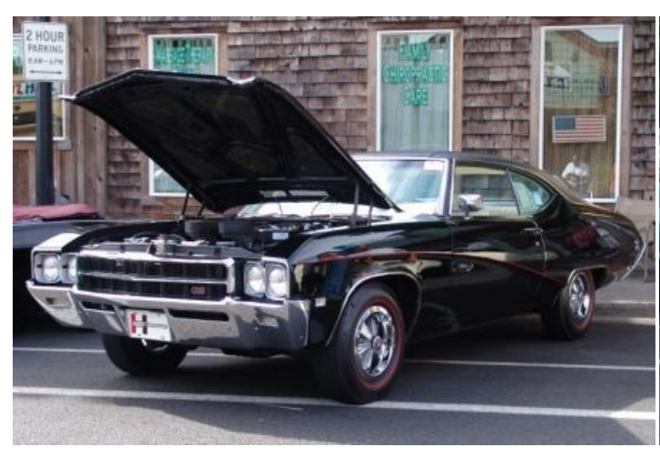
Dick Nali's '69 GS 400 won the GS/GSX Class