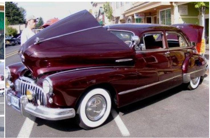
The '46-'53 modified class was won by a Monte Osier's 1946 Super