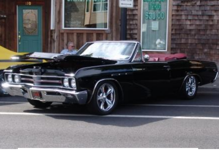
The 1965 and later modified class winner was Duke and Brenda Charpentier's '67 GS400